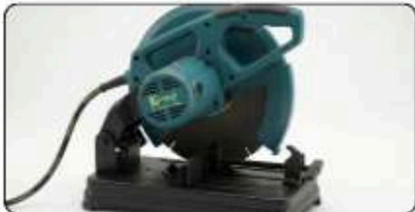
Cut Off Machine MC14

We offer exceptionally high-quality armatures for essential power tools like Angle Grinders, Marble Cutters, and Rotary Hammers.